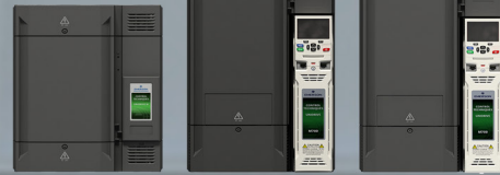
High Power Modular AC Drives