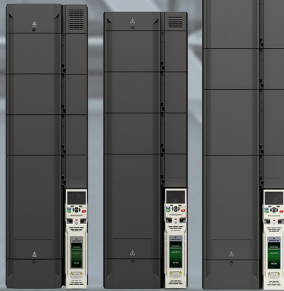
Large Single AC Drives